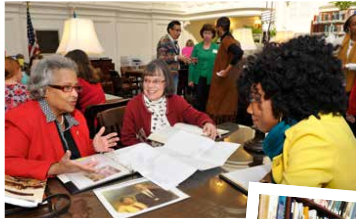
The DAR Library’s vast holdings are available free of charge to DAR members and the public.

Library staff members regularly assist DAR members and staff with new genealogical resource projects. For instance, the DAR Library will be working with the Patriot Records Project to acquire microfilm or digital copies of rare Revolutionary War records, which will enable member volunteers to index the documents from home. ■■■